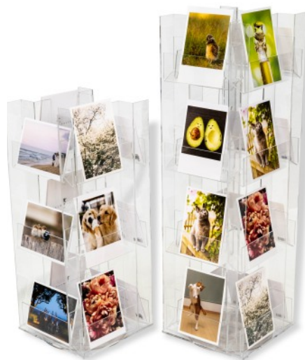
Counter Top Models