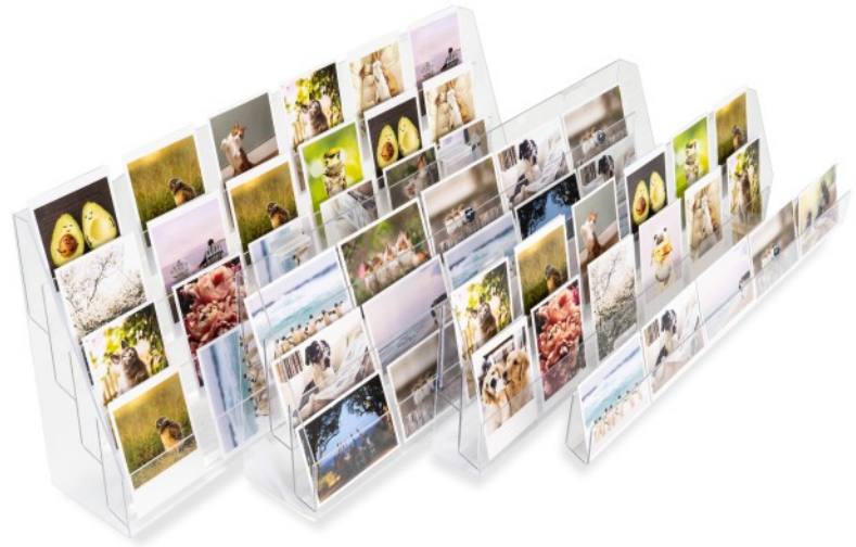
Wall Mount, Slatwall Mount, or Counter Top